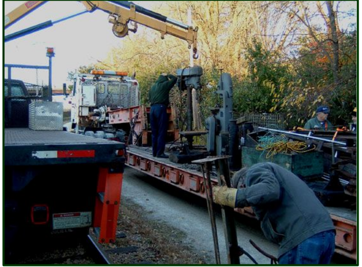
The boom on MTM's flatbed truck is about to lift off a heavy-duty drill press. Phil Epstein is next to the drill press in the green sweatshirt.