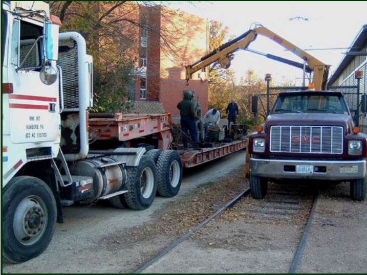
The boom on MTM's flatbed truck came in real handy.

Back in late 2009, the Museum successfully bid on several items that were being dispersed from the Lake Shore Electric collection of streetcar parts. Eleven months later our materials finally were delivered to the Museum's Excelsior car barn. The major item in the delivery was the Dupont No. 35 truck that is destined to go under and power Winona No. 10. We'd like to thank Phil Epstein who graciously arranged for use of the Minnesota Transportation Museum's boom truck which was most helpful during the unloading the items from the delivering flatbed truck. Below are some photos of the delivery of these much needed items.